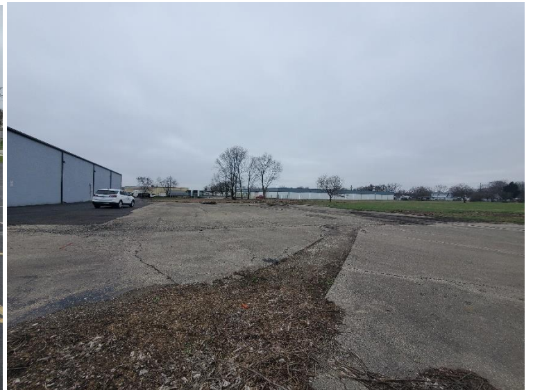
Rear of Subject Site