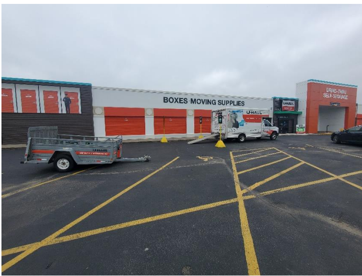
Proposed Canopy Location