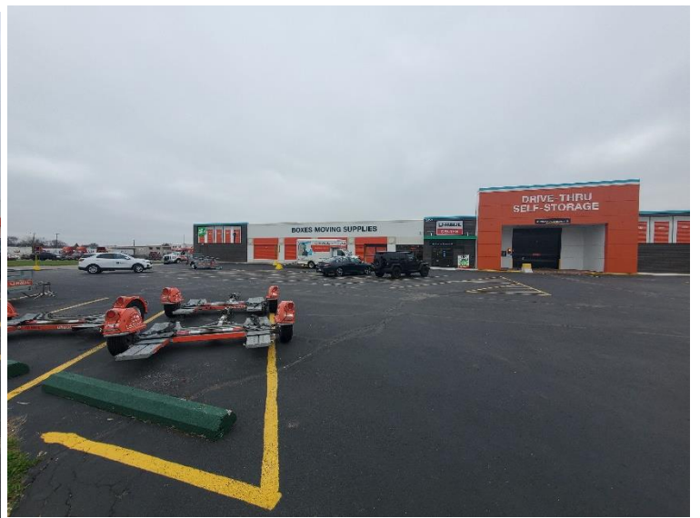
View from Harshman Rd