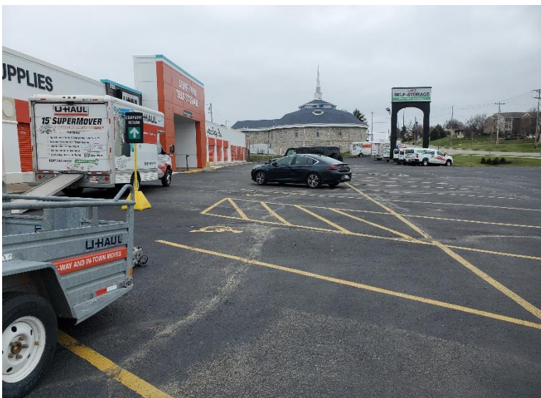
View from Transportation Drive