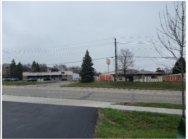
Adjacent Property Across Harshman Rd