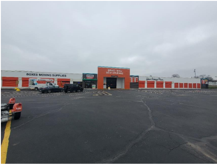
Front of Subject Site